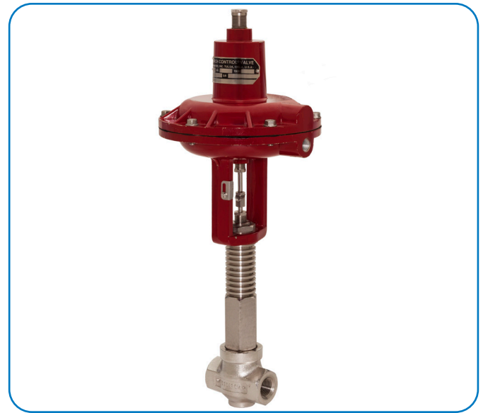
Shown with Type 754 Actuator